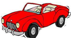
Car driving at constant velocity