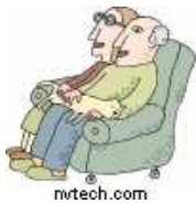
Sitting in a chair