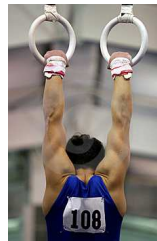
Hanging on a rope.